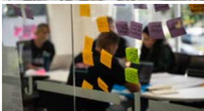
Hack Tāmaki was one of the most diverse hackathons in Aotearoa

“One of the students I took to watch got so immersed in that out-of-the-box thinking she’s found a whole new way to run her business - and we also developed a relationship with Jacobsen Flooring which meant four of our students were able to do work placement there.