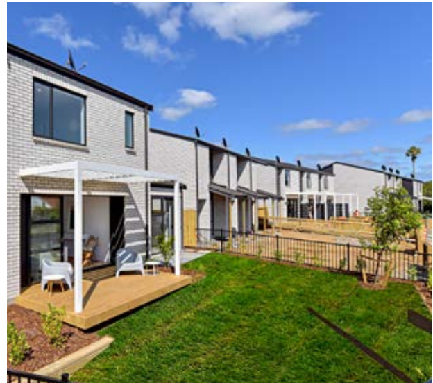
J Derna-Tobruk neighbourhood

Derna-Tobruk will include 104 new state, affordable and private market homes. Stage 2 and 3 are currently under construction and will be a mix of state and private market homes ranging from 2-5 bedrooms, with development partner Fletcher Living. All homes in the Derna-Tobruk neighbourhood are scheduled to be finished by 2023.