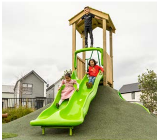
Aveline Place Playground

A children's playground in Aveline Place is also now available for families to enjoy.