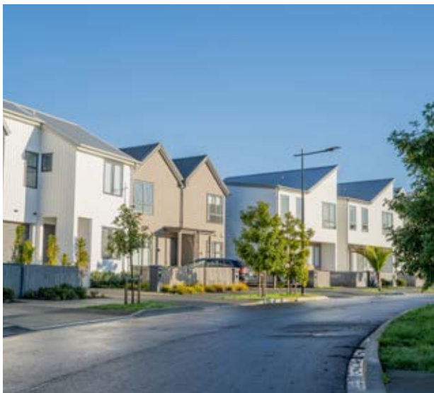
A Fenchurch neighbourhood

About 400 state, affordable and private market homes will be built in the Fenchurch area. Of those, 369 houses have been completed so far, including more than 150 state homes.