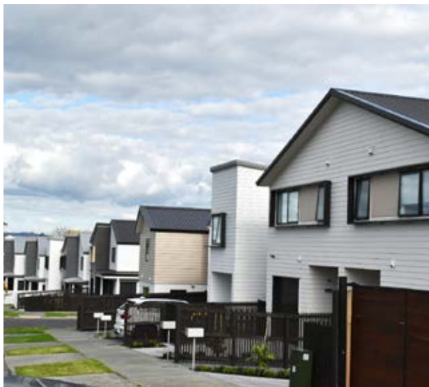
B Overlea neighbourhood

Over 140 state, affordable and private market homes will be built in the Overlea area, which includes Elstree North Reserve, Elstree Ave, Leybourne Circle and the shops fronting West Tāmaki Road.